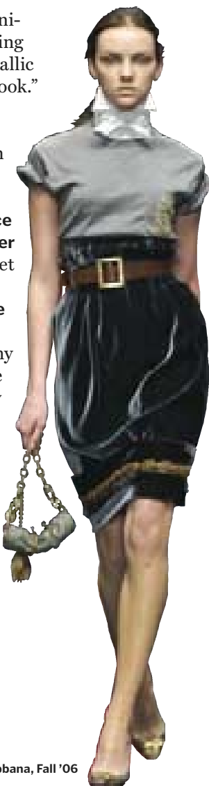
Dolce & Gabbana, Fall '06

MUST-SEE SHOW "Marc Jacobs stands alone. You do not know what he's going to do, and it is so rejuvenating to see his remarkable creativity. You always leave his show saying, 'Wow!'"