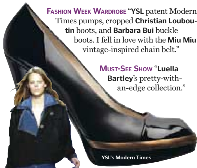
YSL's Modern Times

MUST-SEE SHOW "Luella Bartley's pretty-with-an-edge collection."