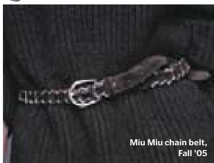
Miu Miu chain belt, Fall '05

YOUR FALL LOOK "I want minimal and clean, and I'm going to firmly embrace the metallic sweater and bubble skirt look."