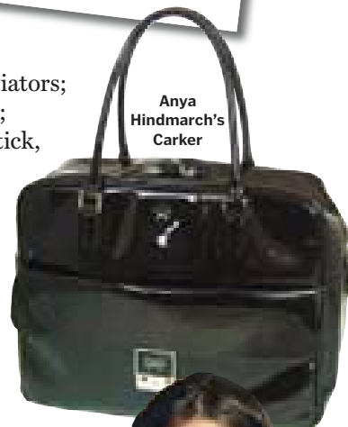
Anya Hindmarch's Carker