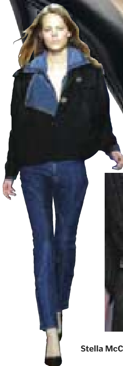
Stella McCartney, Fall '06